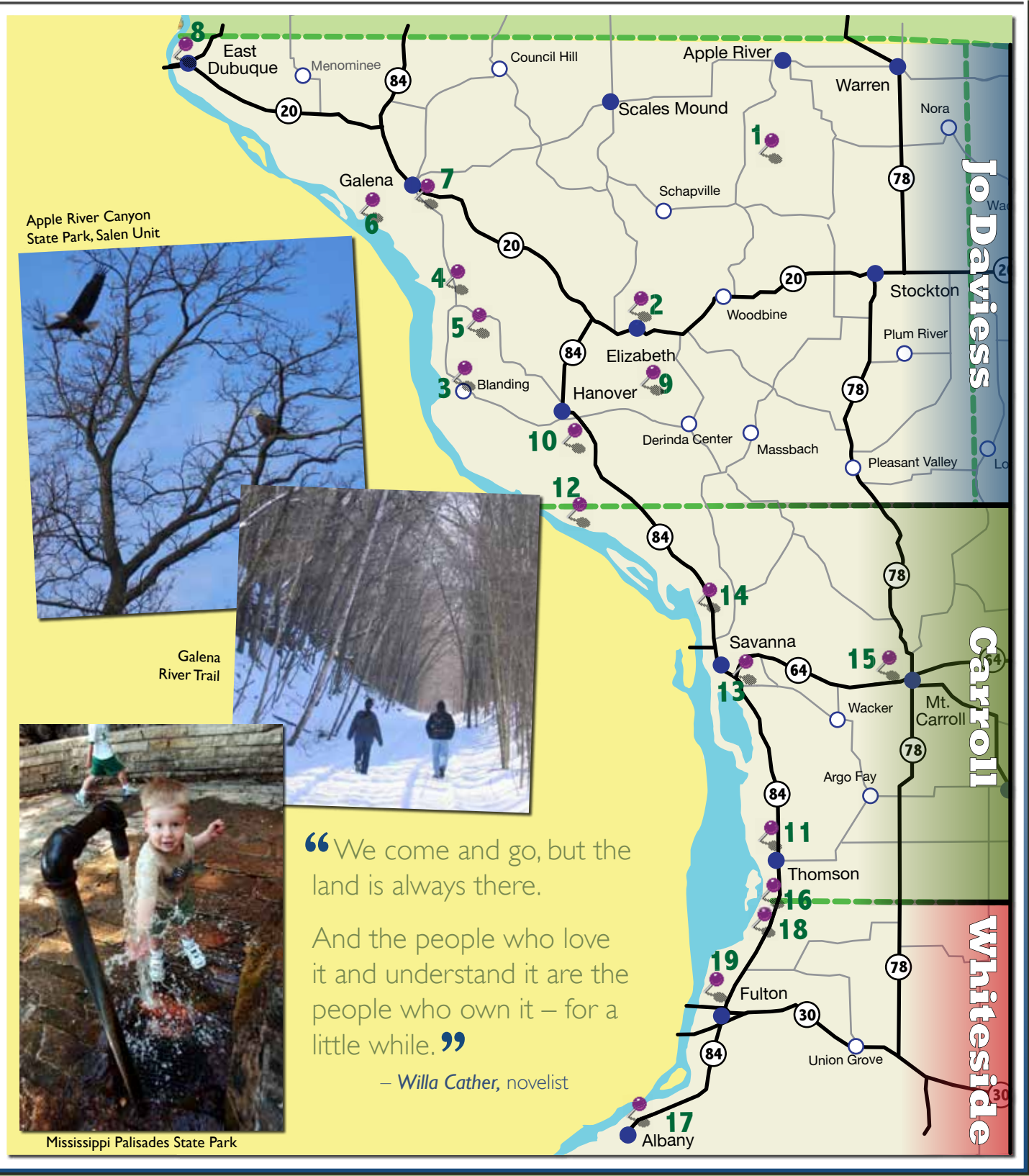
Apple River Canyon State Park, Salen Unit