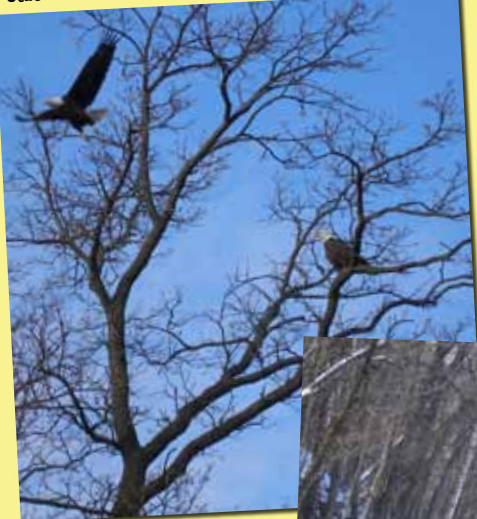
Galena River Trail