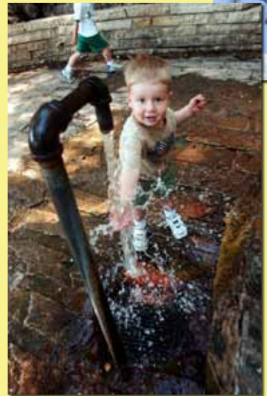
Mississippi Palisades State Park

“We come and go, but the land is always there.